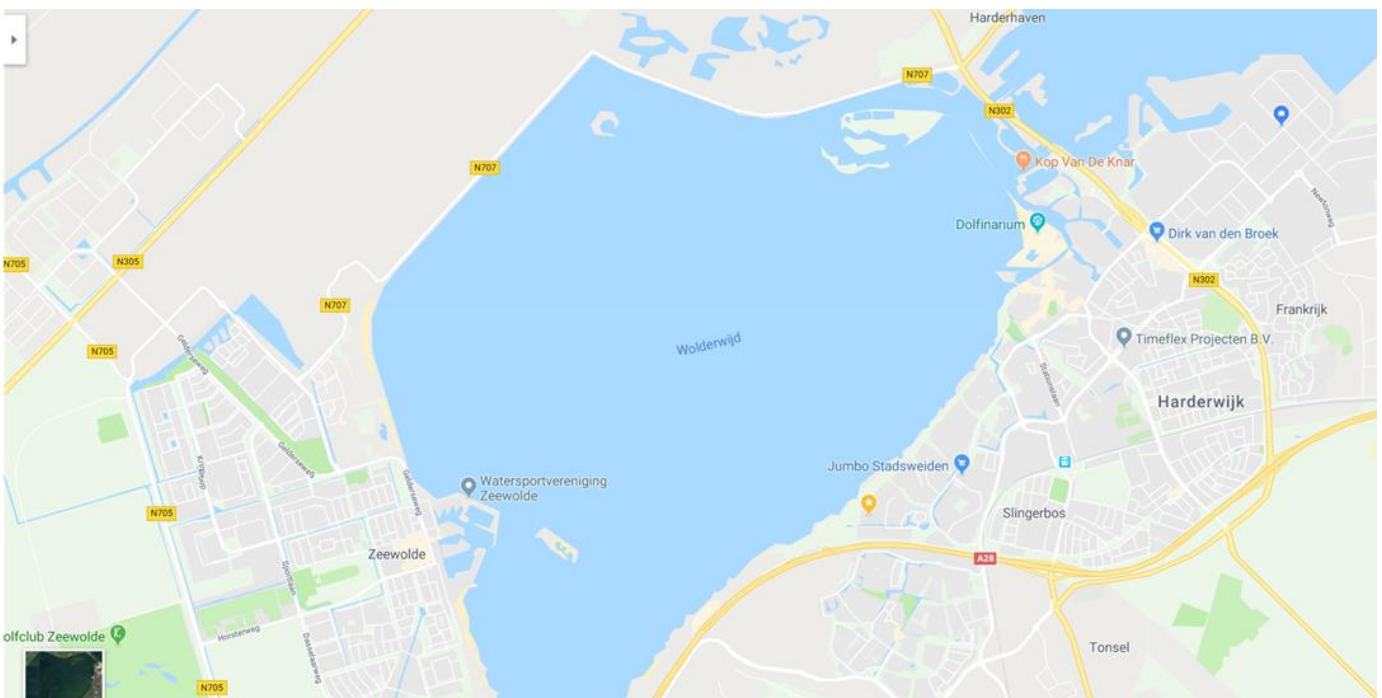
Watersportvereniging Flevo/Jachthaven De Knar, Knarweg 2-4-6, 3846 AH, Harderwijk (The Netherlands)